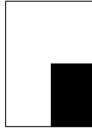
Quarter (1/4) Page